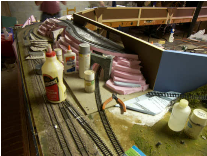
The new logging spur snakes through the woods above the wye that leads to the new interior staging yard.