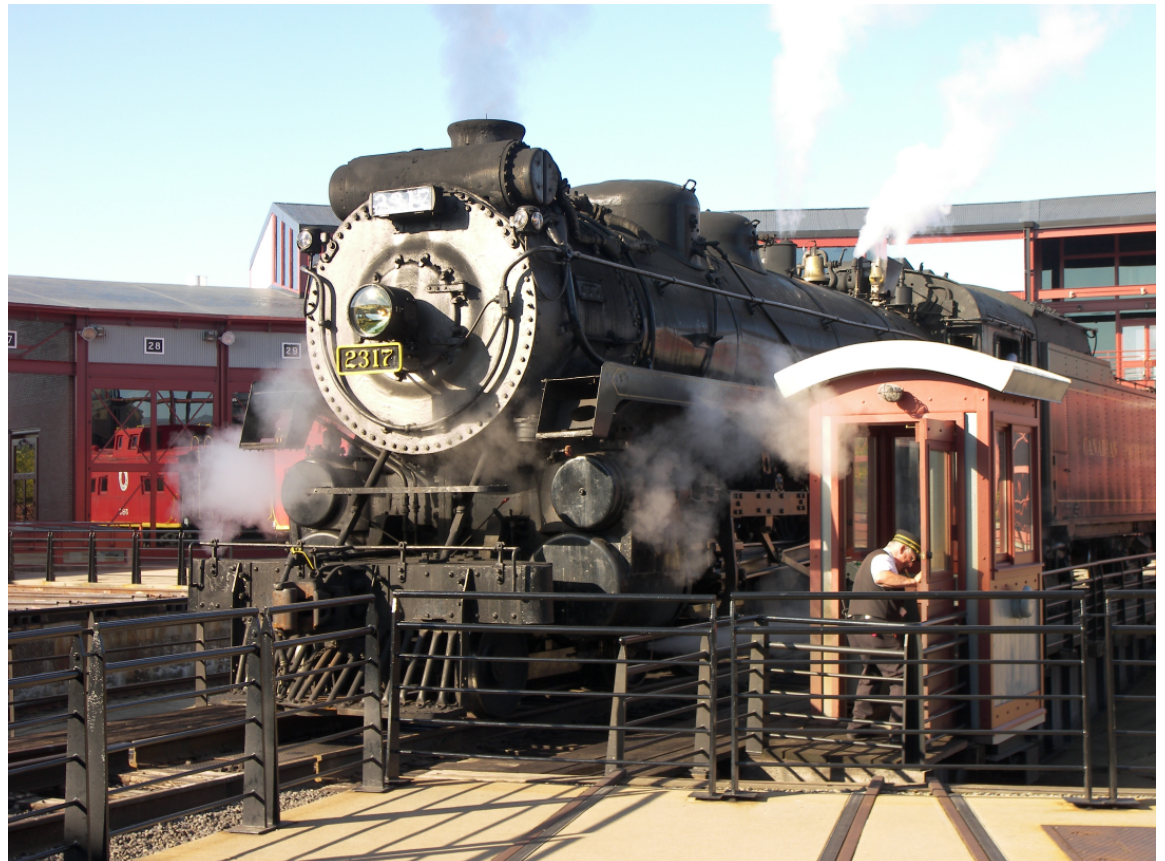
Scranton, PA, October 10, 2008

CRM&HA 2009 Train Show Easley, SC Feb 28 - Mar 1