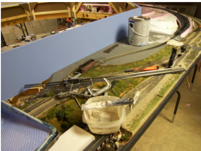
Located on the end and corner where the dairy farm and rock mountains had been, the new spur will