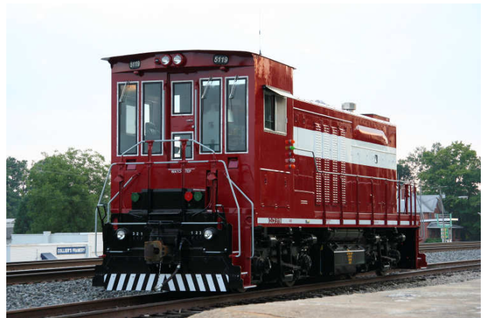
AFTER: Remote radio control unit CLCX 5119 (ex-G&O 8314; ex-ICG 8314; nee UP GP9B 188B) awaiting delivery to Alcoa Terminal Railroad in Alcoa, TN as seen in Easley, SC on 8/18/2008.