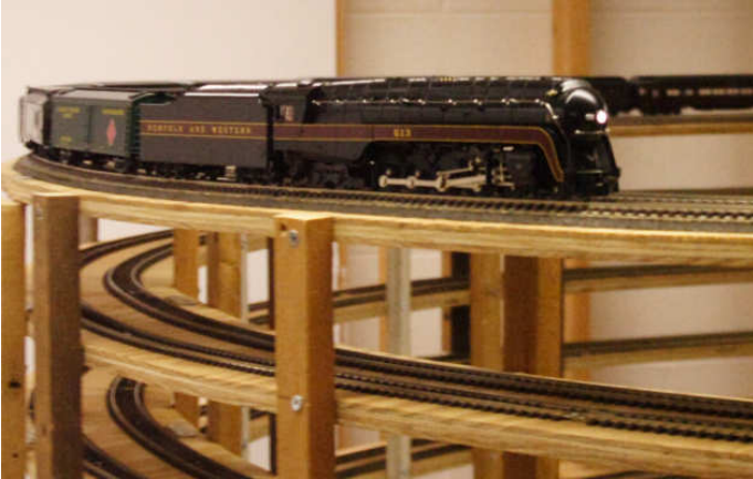
A new, unassisted J-class model leads the Birmingham Special up one of four helixes on Bob's layout at the Christmas party.