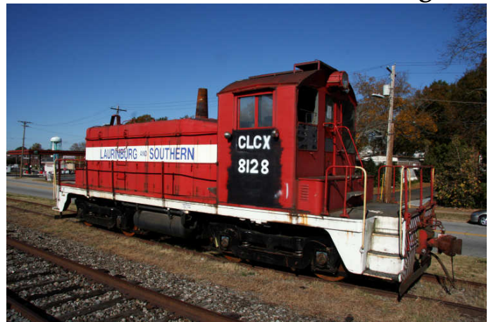
BEFORE: CLCX #8128 ( ex-JRWX 117; ex-LRS 117; nee Union Railroad SW1 465) seen in Easley, SC on 11/09/2008 awaiting movement to Chattahoochee Locomotive Company in Pickens for rebuilding.